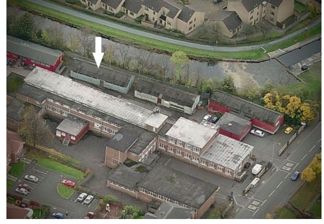
DALMUIR COMMUNITY CENTRE DUNTOCHER ROAD CLYDEBANK G81 4RQ